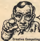
Creative Computing Magazine

From the "Lesly Circuit" series, this eagerly anticipated new novel is certain to figure among the nominees for next year's Hugos and Nebulas awards and marks a new stage in the career of Larry Niven. In effect an expansion and development of his story "Rammer" the novel's next stage was